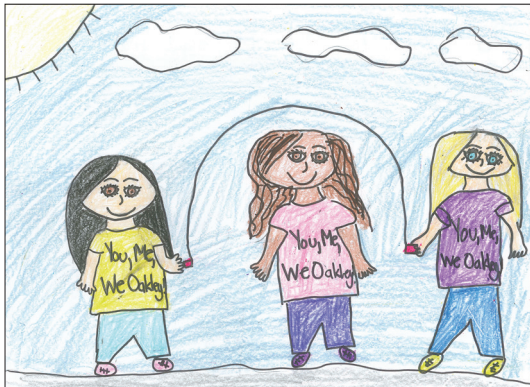
Un ejemplo de arte estudiantil

El programa You, Me, We Oakley! , el cual organiza/patrocina eventos como los talleres de ciudadanía, Día de los Muertos , Leer Para Crecer etc., inmortalizara este mensaje a través de la escultura de varios niños tomándose de las manos alrededor de el mundo.