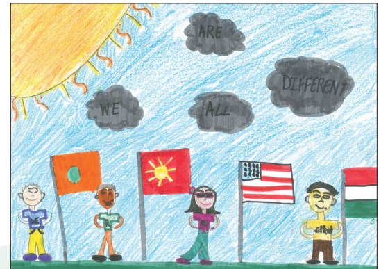
Un ejemplo de arte estudiantil

La escultura será complementada por azulejos de cerámica de arte estudiantil. Los azulejos ilustran varios principios como "tratar a los demás en la forma que le gustaría ser tratado, esforzarse a entender culturas diferentes y desafiar los mitos y estereotipos que dividen."