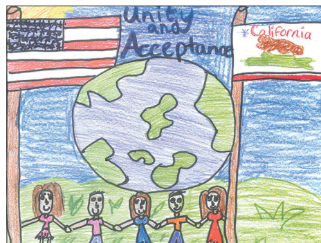
Oakley children's art for the new monument

Program activities aim to create opportunities for our diverse residents to come together and better understand one another, appreciate each others' stories, and to recognize their common desire to build a stronger, safer, and more vibrant community.