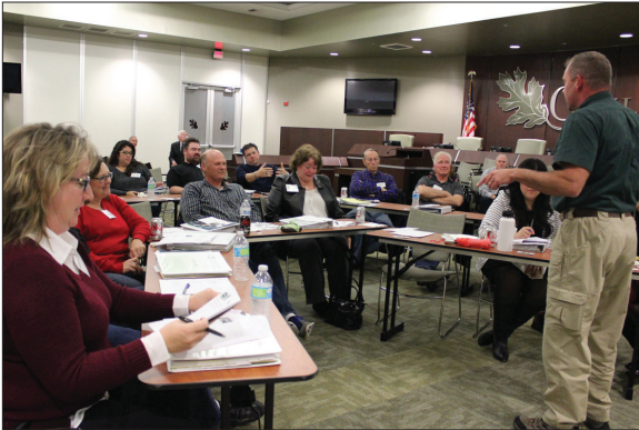
Citizens' Leadership Academy in session

Last month, the Oakley 2014 Citizens' Leadership Academy yielded its first graduating class of 23 residents. The graduates were recognized by the City Council during the January 13th City Council Meeting.