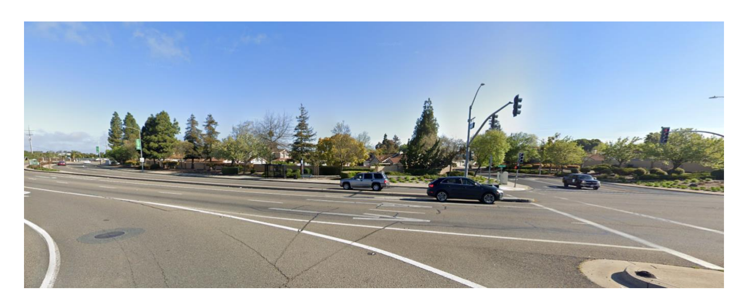
To the east : single-family residential uses