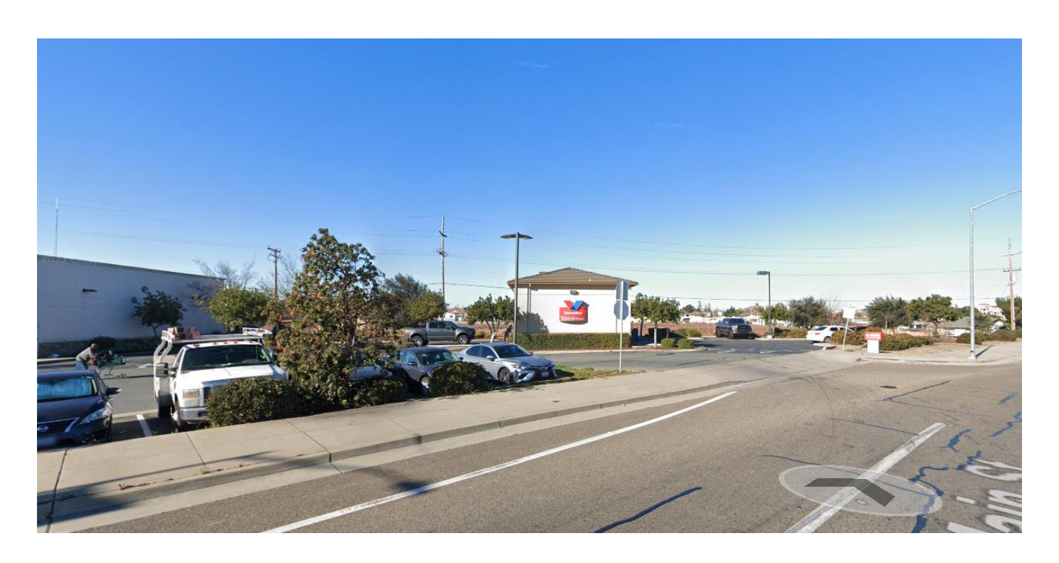
To the north : a Valvoline Instant Oil Change business